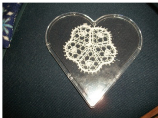
Julie Brock - Buck's Point