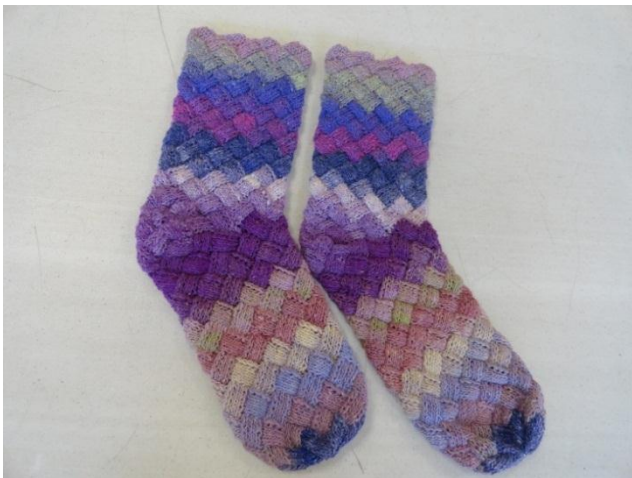
Lucy – Entrelac socks