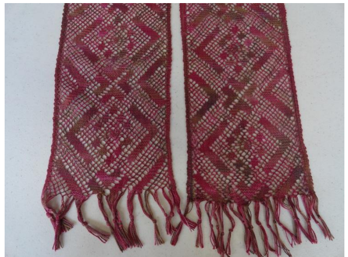
Ana – lace scarf