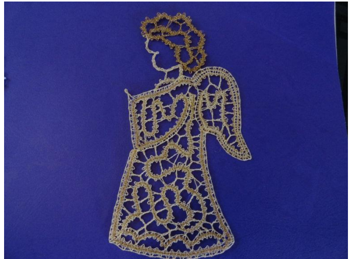
Julia –Cantu lace angel